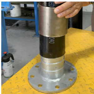
Flange coupling and ferrule ready for swaging