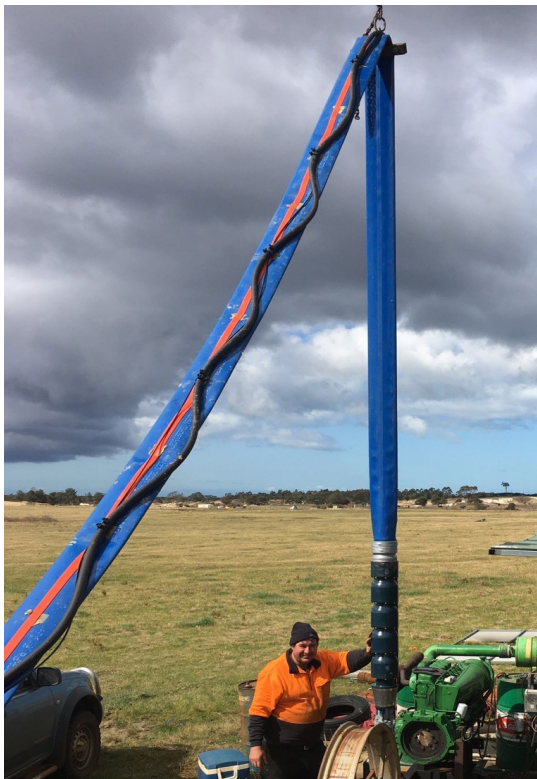
Power cable secured with cable ties

Cable ties are a great way to secure your power cable to Flexibore®, our flexible riser. Flexibore® is manufactured with a coloured strip that creates loop attachment points to secure your power cable. For smaller diameter power cables for bores up to 150 m deep, cable ties are sufficient and quicker to handle. For the Flexibore® warranty to remain valid, only Crusader Hose-approved heavy-duty cable ties may be used.