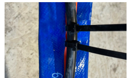
Heavy-duty polypropylene cable ties