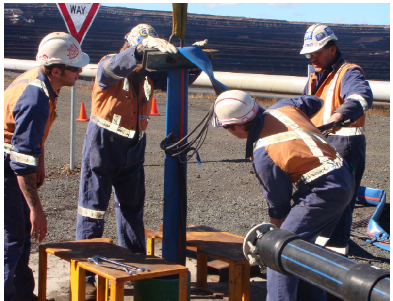
Lifting clamp for easy and safe Flexibore® installation