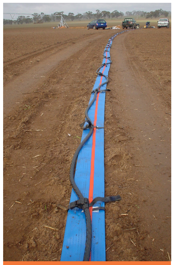
Power cable secured with PU straps

Flexibore<sup>®</sup> is manufactured with a coloured strip, making loop attachment points to secure your power cable. Polyurethane (PU) straps are the suggested attachment method for longer power cables over 150 m deep instead of cable ties.