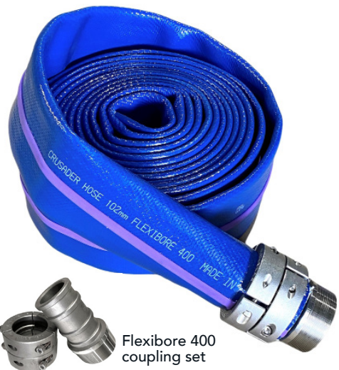
Flexibore 400 coupling set