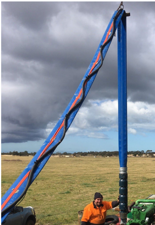
Well-snaked power cable secured with heavy-duty Cable Ties

Cable Ties are a quick and easy way to secure your power cable to Flexibore, our flexible rising main. Flexibore is manufactured with a coloured strip that creates cable attachment loops to secure your power cable. Depending on the thickness of the cable, one or two Cable Ties are required at each loop.