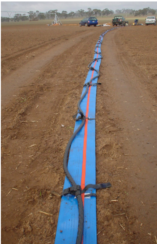
Power cable secured with FlexiStraps

Flexibore is manufactured with a coloured strip, making cable attachment loops to secure your power cable. FlexiStraps are the suggested attachment method for longer power cables over 150 m deep instead of cable ties.